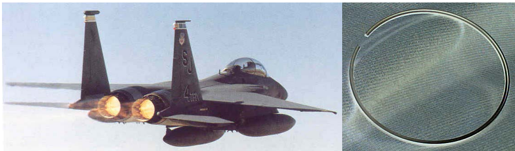
The F-15 Eagle utilizes the Pratt & Whitney F100 afterburning engine series