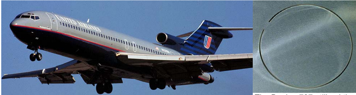
The Boeing 727 utilized the Pratt & Whitney Aircraft JT8D series engine.

Combustion Technologies manufactures Seal Rings for many different applications. Some are installed in jet engines and some in artillery guns used by our armed forces. Most are produced for use in aircraft. They range in size from .625" dia to 8" dia in materials such as bronze, ni-resist, cast iron and stainless steel.