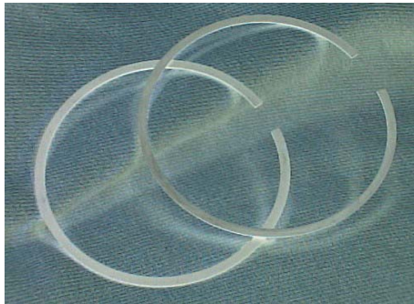
A DeHavilland Otter powered by the Pratt & Whitney R1340 Wasp